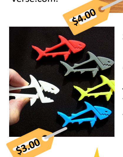
SHARKZ... Fun Multipurpose Clips by muzz64 at thingiverse.com.

Octopus Stand Version Three by notcolinforreal at thingiverse.com.