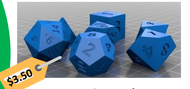
Dice Set for DnD/D&D by Udos3DWorld at thingiverse.com.