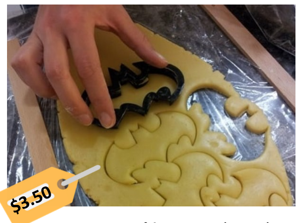
Batman Cookie Cutter by <u>Buhi</u> at thingiverse.com.