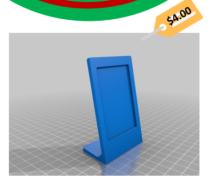
Fuji Instax Mini picture frame by malopezn at thingiverse.com.

Most prints cost between $3-10. The cost of a print is determined by the size and density of the design.