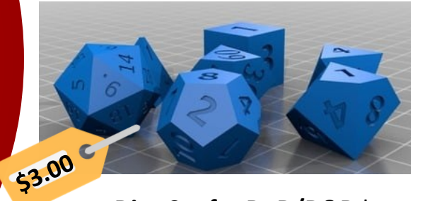
Dice Set for DnD/D&D by Udos3DWorld at thingiverse.com.