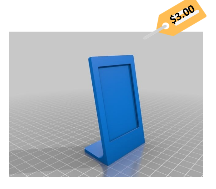
Fuji Instax Mini picture frame by malopezn at thingiverse.com.

Most prints cost between $3-10. The cost of a print is determined by the size and density of the design.