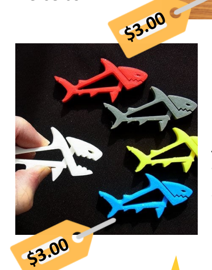
SHARKZ... Fun Multipurpose Clips by muzz64 at thingiverse.com.

Octopus Stand Version Three by notcolinforreal at thingiverse.com.