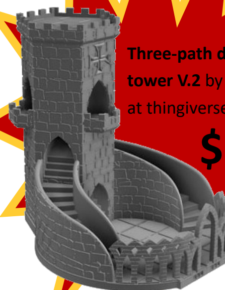
Three-path dice tower V.2 by bainite at thingiverse.com.